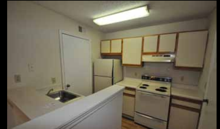
Kitchen & Breakfast Bar