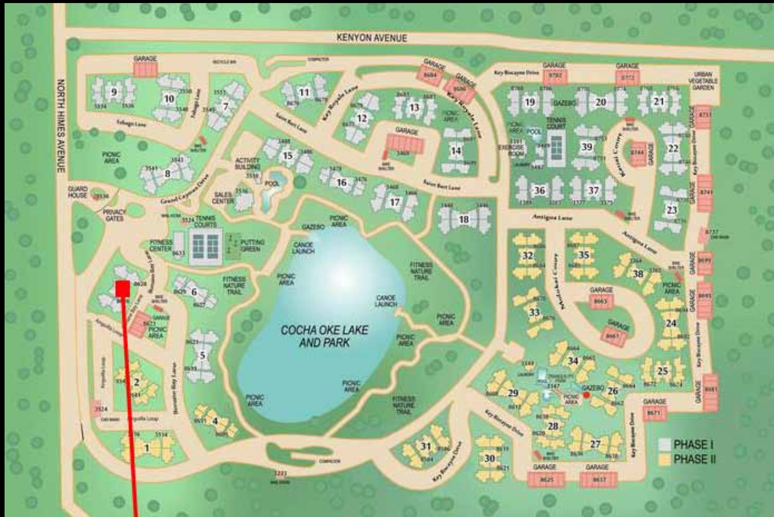
8628 Bonaire Bay 202 Faces the parking lot