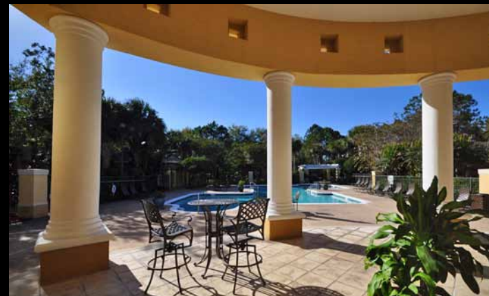
Clubhouse & Pool