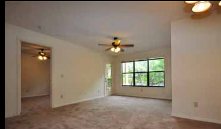
Living & Dining room