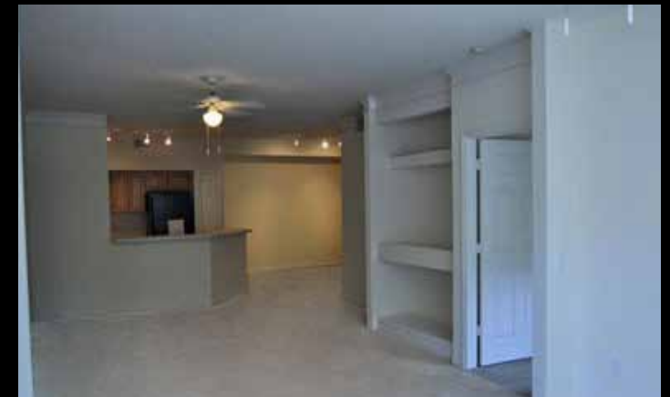
Living & Dining