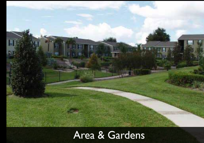
Area & Gardens