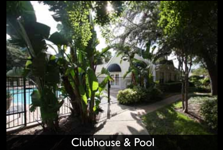
Clubhouse & Pool