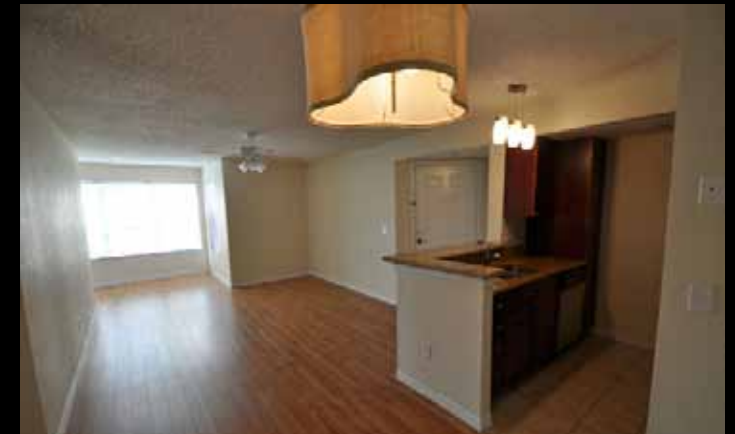
Living & Dining