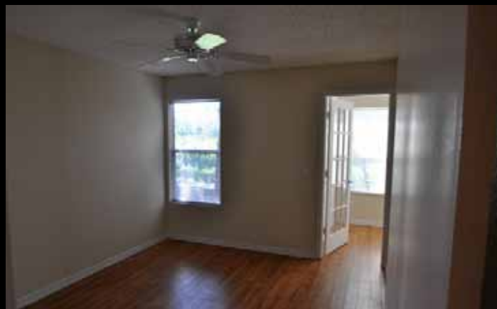
Bedroom and Sunroom