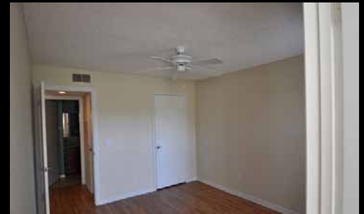
Bedroom & Walk-in Closet