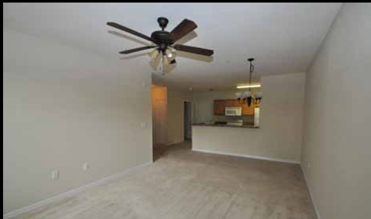
Living & Dining room