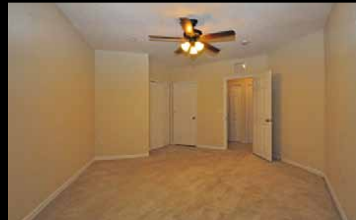
Living & Dining room